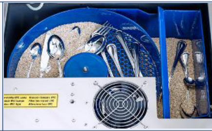
The cutlery is spirally transported upwards through a high-grade sterile granulate and is dried and polished. The installed ventilator prevents that granulate comes out of the machine.