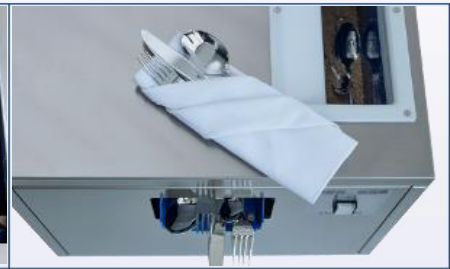
The regular use of the cutlery polishing machine TD 2000 keeps your cutlery shining.