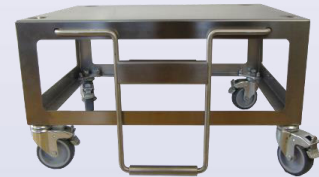
Option: mobile underframe TD 2000 43 x 53 x 31 cm (l x w x h)

The constant use of the cutlery polishing machine TD 2000 reduces the oxidation of cutlery in a remarkable way and makes it look noticeably better.